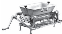
Kook E King Benchtop Manual

DONUT FRYERS DONUT ROBOTS® FINISHING ICING GLAZING PROOFING DEPOSITING RACKS/SCREENS