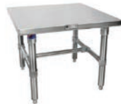
John Boos Stainless Steel Table