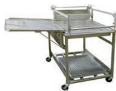
Belshaw Donut Glazer