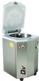
JAC Dough Divider