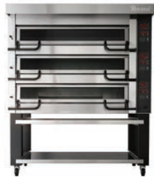
Revent Deck Oven