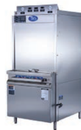
LVO Pan Washer