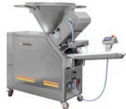
Artezen Dough Divider