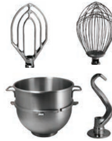
Mixing Bowls & Attachments