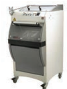
JAC Bread Slicer