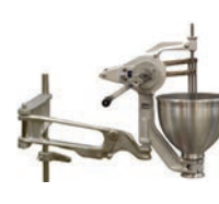
Belshaw Cake Donut Depositor