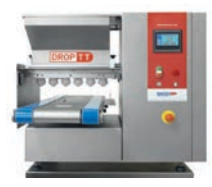
Bakon Table Top Depositor