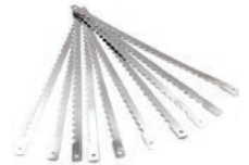
Bread Slicing Blades Artisan Blades