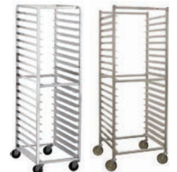
Pan Rack Donut Rack

For more info please visit www.strattonsales.com , or call (801) 973-4041