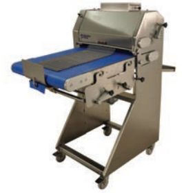
Dough Tech Bread Moulder