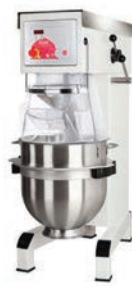
Varimixer Planetary Mixer