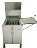
Belshaw Donut Fryer