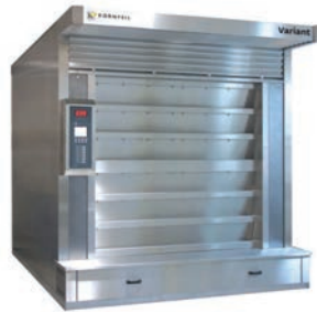
Kornfeil Deck Oven