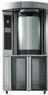
Revent Rack Oven

RACK OVENS DECK OVENS COMBI OVENS TUNNEL OVENS REFRIGERATION PROOFING RETARDING