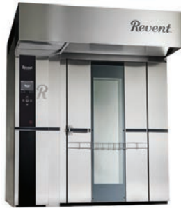
Revent Rack Oven