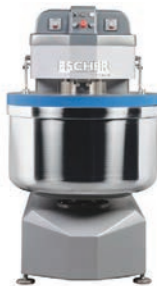
Escher Spiral Mixer

SPIRAL MIXERS PLANETARY MIXERS DOUGH DIVIDERS DOUGH ROUNDERS DOUGH MOULDERS DOUGH SHEETING WATER METERS