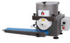
Erika Record Formatic Cookie Machine