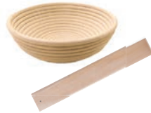
Proofing Baskets Baguette Boards

ARTISAN TOOLS SMALLWARE SCOOPS SCRAPERS KNIVES + MORE