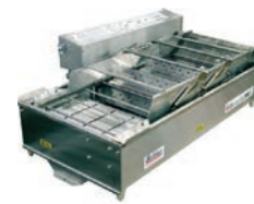
Belshaw Donut Robot®