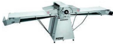
Rondo Reversible Sheeter