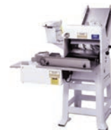
Oliver Bread Slicer