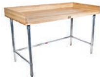
John Boos Tables

PAN WASHERS TABLES/STANDS BREAD SLICERS BAKING PANS SPECIALTY TOOLS TYING MACHINES PAN RACKS