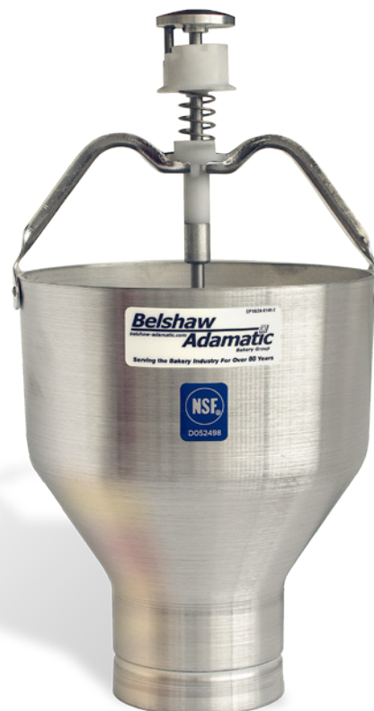
Above: Type K Pancake Dispenser (Item# 8504011)