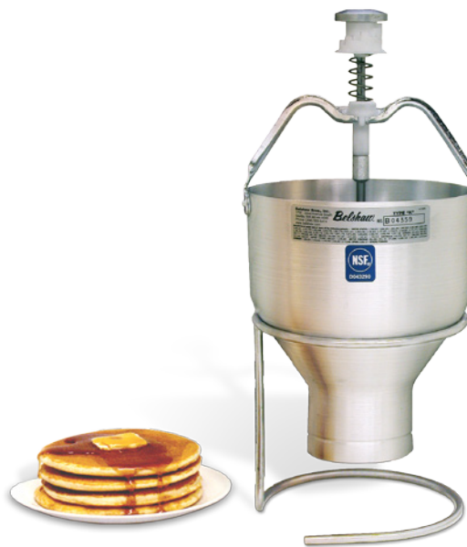
Below: Type K Pancake Dispenser with Stand (Item #K-1016WSS)