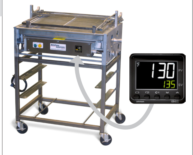
HI18F Icer (with electronic temperature controller)