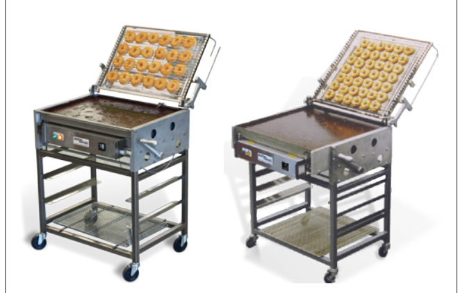
Left: HI18F Icer (holds 18"x25" glazing screen with 2 dozen donuts) Right: HI24F Icer (holds 23"x23" screen with 3 dozen donuts)