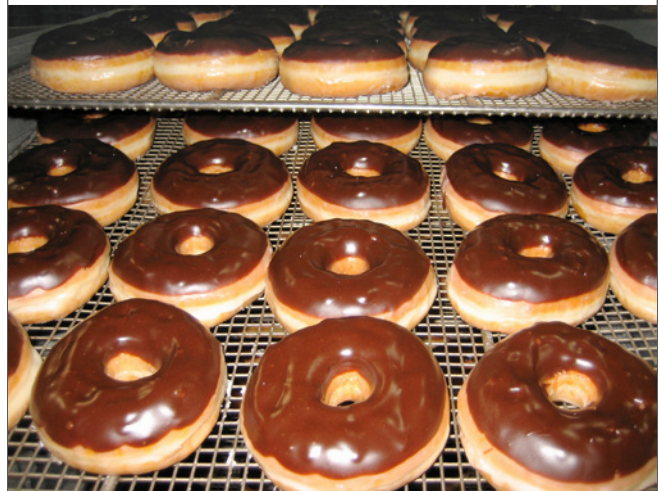
Donuts iced with HI24F Icer