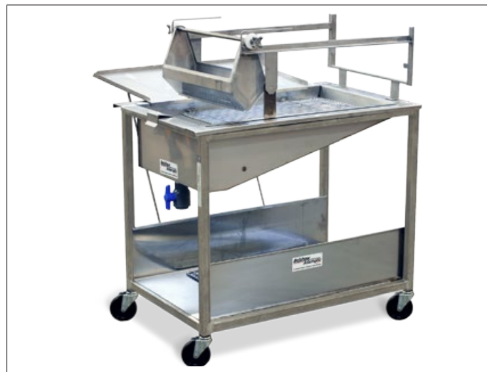
HG18EZ Glazer (Glazing screens supplied separately)