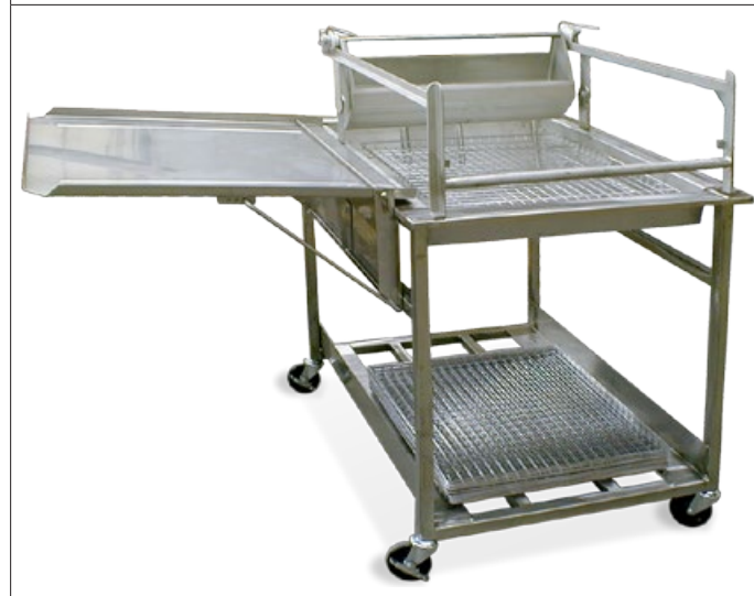
HG24EZ Glazer (Screens supplied separately)