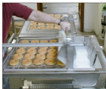
EZLift Mechanism – Glaze Applicator on rails