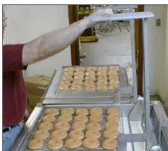
EZLift Mechanism – Tilting to refill applicator