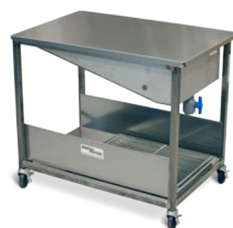
HG18EZ Glazer cover