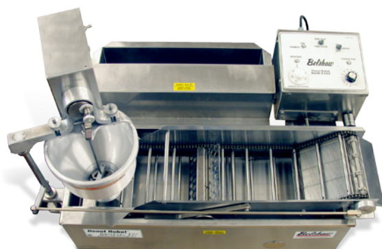
Donut Robot® Mark II GP Gas