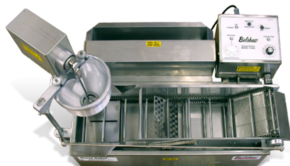
Donut Robot® Mark II Gas