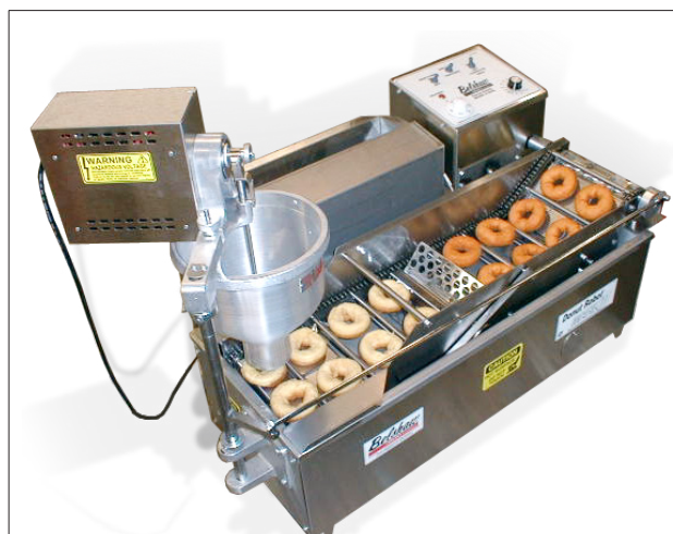
Donut Robot® Mark II Gas with Donuts