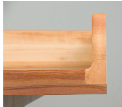
COVED RISER (FRONT VIEW)