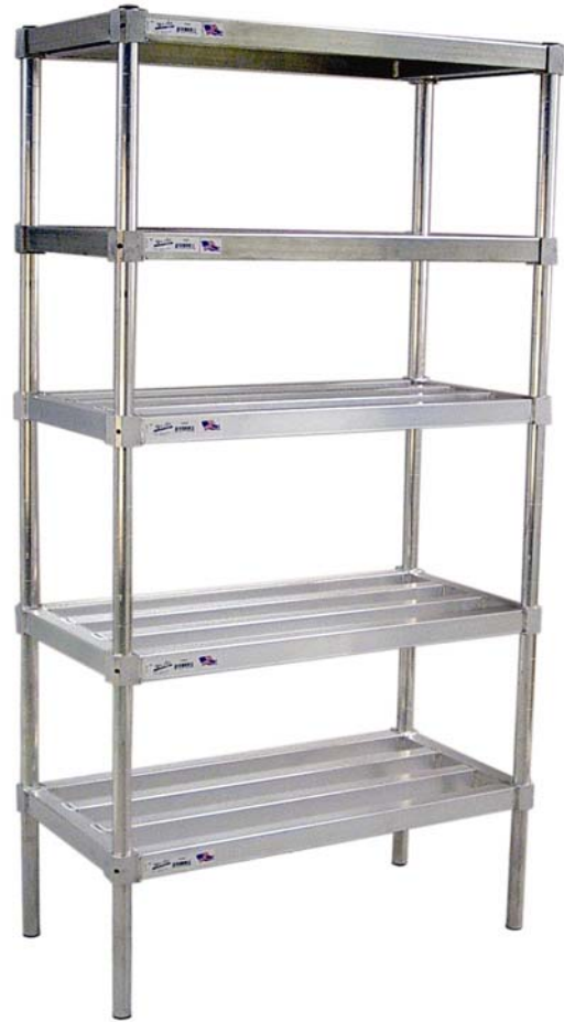
Adjust-A-Shelf – H.D. Series

These shelving units have a Lifetime Guarantee against rust and corrosion and also carry a Lifetime Guarantee against workmanship and material defects.